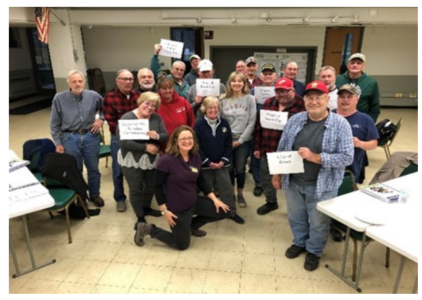
Lake County officials completed Citizen Planner training, a program designed to increase knowledge and encourage best practices around planning and zoning while reducing government liability.

In collaboration with the Lake County Community Food Council, MSU Extension has developed a gardening project with the Grand Oaks Nursing Center. This collaboration has created four community garden beds and three resident wheelchair accessible beds. They have been successful in doing some garden to table projects for the residents and staff and interest is growing for next year as those who have participated, share their excitement.