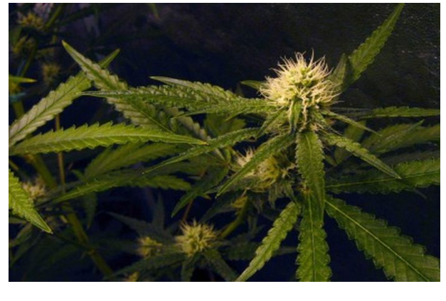
MSU Extension provided education regarding interpretation and implementation of regulations regarding the Michigan Medical Marijuana act in Lake County.

Providing education and technical support to help create successful commissions and local government is the foundation of the work MSU Extension's Government and Public Policy Educators. Together, we have assisted in the development of a recreation plan for the County, provided land-use trainings, assisted with the watershed plan for the Little Manistee River, assisted with the Parks and Recreation Commission, and supported strategic planning for a new county ORV facility.