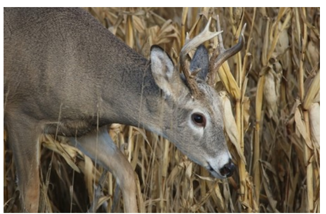
Feed Crop education was provided to several residents of Lake County in 2019.

Homeowners often have insect infestations or plant diseases that they are unfamiliar with and need help addressing. MSU Extension provides soil testing, plant and insect identification, disease identification and treatment, Smart Gardening resources, and a toll -free Lawn and Garden hotline. The Lake County MSU Extension office provides assistance to many customers with basic home gardening concerns. Additionally, 38 soil tests were completed for Lake County residents in 2019.