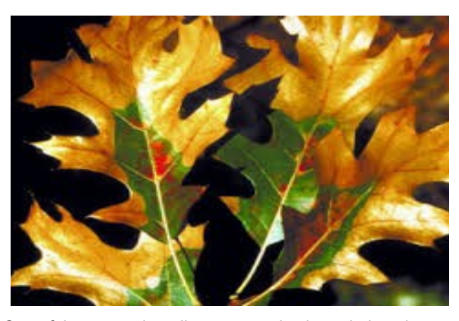
One of the many plant disease samples brought into the Extension office for identification.

MSU Extension continues to work closely with the Lake County Community Food Council to provide guidance and resources that are having an impact. At the Bread of Life food pantry in Baldwin, MSU Extension continued to provide and expand workshop offerings related to nutrition, food safety for pantries, and cultural diversity. The pantry was featured in a video with interviews highlighting local pantry users and volunteers. The video will highlight the MyChoice Pantry transition and will be used to guide other Extension instructors and educators across the state in regards to working with pantries to support a food choice model.